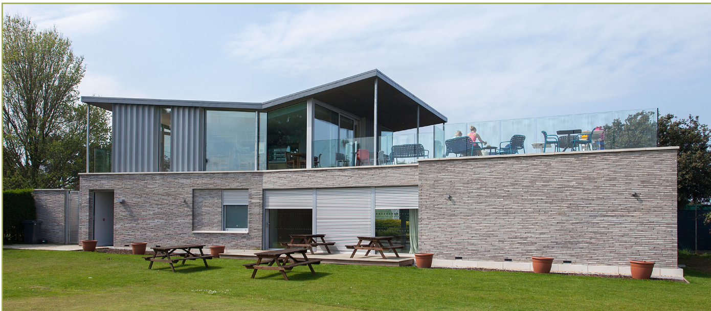
INTEGRATED SECURITY, PORTSMOUTH TENNIS PAVILION