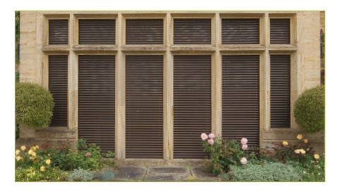
FULLY INSULATED STRUCTURAL LINTEL WITHOUT COMPROMISE ON DESIGN