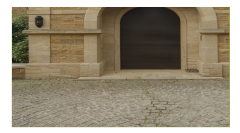
TO PROPERTY FUNCTION AND DESIGN