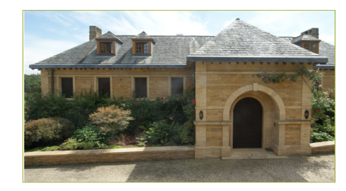
UNOBTRUSIVE, HIGH PERFORMANCE SECURITY SYSTEM

Providing an unobtrusive alternative to the traditional hood box, the Equilux Built-In Shutter incorporates the shutter system within a structural lintel. With no visible guide rails or boxes, the original features and architectural design of the residence can remain unaltered yet completely secure once the shutter is deployed.